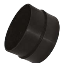
Product Code: MB150