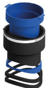
Unisaddle component parts