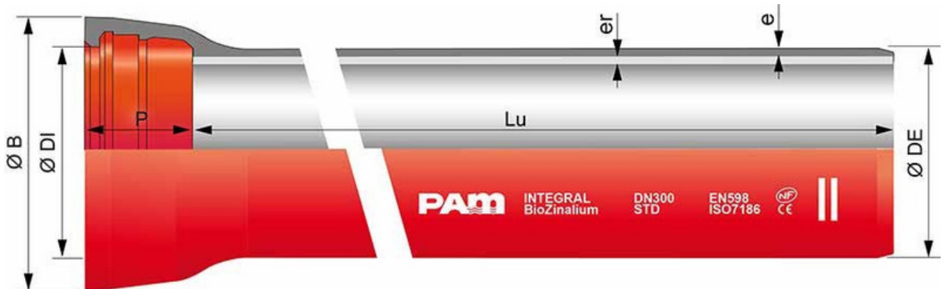
AS/NZS PAM INTEGRAL ZINALIUM® Pipe with Tyton Type Joint DN100-750 DN100-750 PN 35